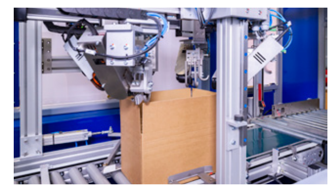
2. CUTTING OF BOX CORNERS