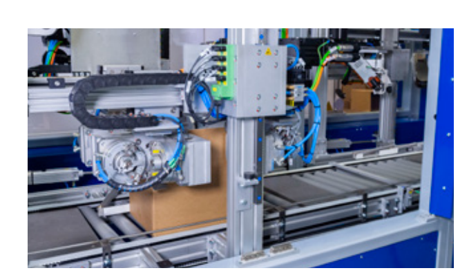
3. FOLDING OF LID FLAPS