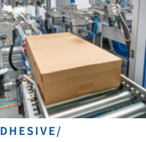
4. SEALING WITH SELF-ADHESIVE/ GUMMED PAPER TAPE OR ALTERNATIVELY WITH LID